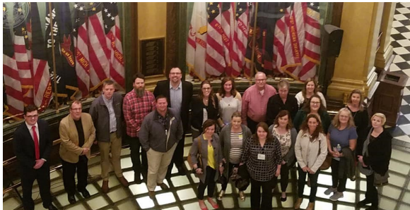
Leadership Montcalm XIX Participants

"I have lived in Montcalm County ALL my life. This was a beneficial and enlightening program. I would strongly recommend Leadership Montcalm to all our community leaders." LM Alumnus